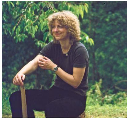
(Cologne, July 1978, aged 25)