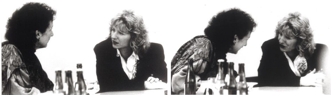
(Feb. 1992, aged 39; left: Margaret Atwood)

The first meeting (with many others to follow) with Margaret Atwood during a three-day conference in Grainau in the Bavarian Alps: