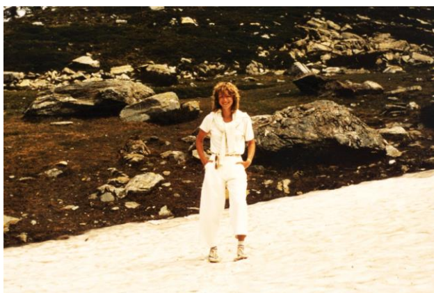
(Swiss Alps, July 1984)