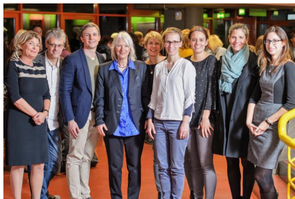
(Konstanz, Oct. 29, 2018)