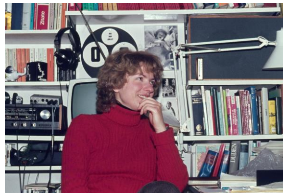
(Cologne, winter 1976–1977, aged 24)