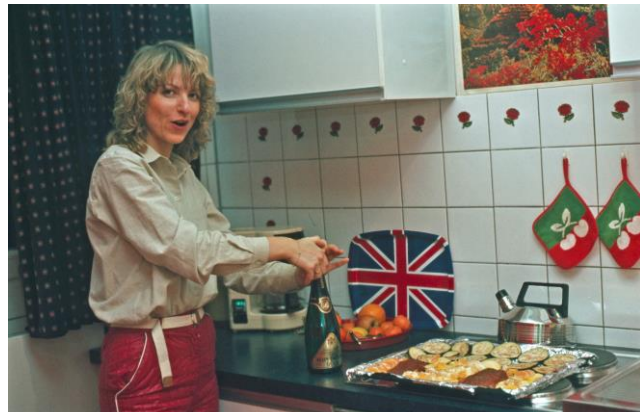
(Cologne, Dec. 1983)