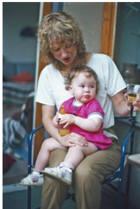
(Bonn, July 1983)