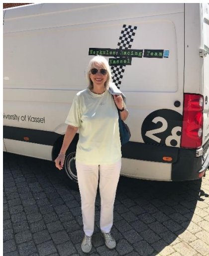
(Kassel, June 27, 2019, aged 66)

After a keynote lecture on the intersections of myth and gender: