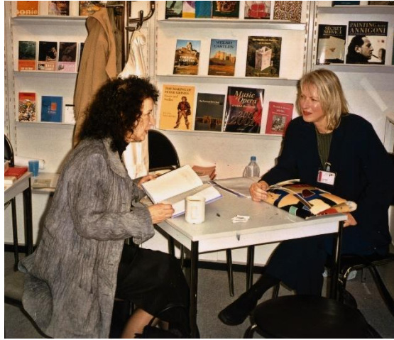
(Oct. 2000; left: Margaret Atwood)