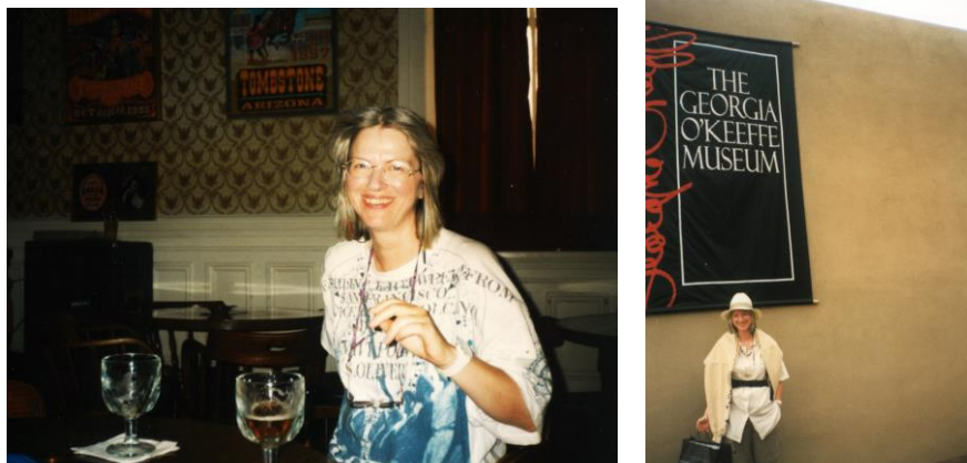
(Aug. –Sept. 1997, aged 44)

Another trip to the American West in the term break of summer 1997, here in a saloon in Tombstone, Arizona, and at The Georgia O’Keeffe Museum in Santa Fe, New Mexico: