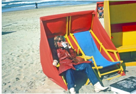
(Holland, North Sea, Aug. –Sept. 1982, aged 29)