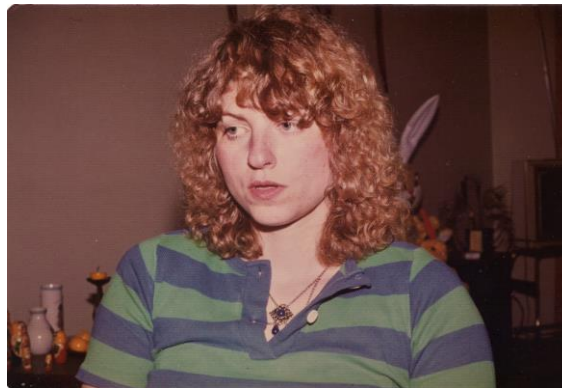
(Vancouver, April 1979, aged 26)

... partly at the University of British Columbia in Vancouver (Aug. 1978–Sept. 1979), resulted in a more determined outlook on life: