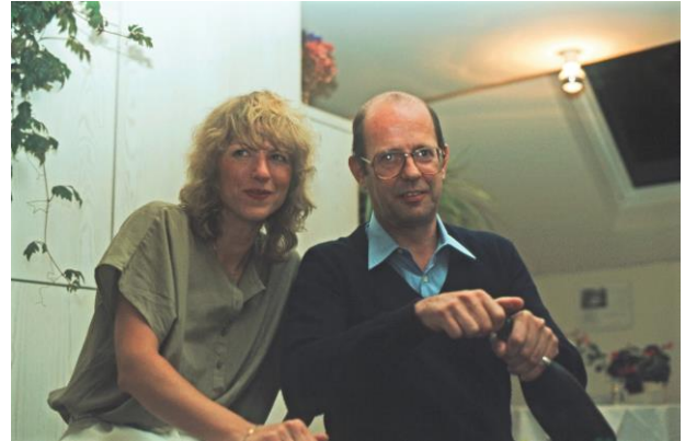
(Cologne, summer 1983)