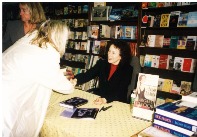
(Sept. 2000; right: Margaret Atwood)

Surprise pre-presentation of the book Margaret Atwood: Works and Impact (Festschrift for Atwood, see below), after an Atwood reading in Boston, Mass., which was one stop on her book tour upon the publication of The Blind Assassin :