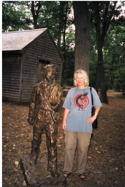
(Sept. 2000; left: a sculpture of Henry David Thoreau)

Traveling in the American East in the term break of summer 2000, here in Concord, Mass., at Walden Pond: