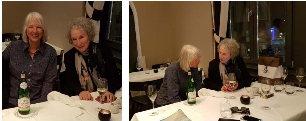
(Frankfurt, Oct. 15, 2017)

In Frankfurt with Margaret Atwood in 2017, celebrating her receipt of the Friedenspreis des deutschen Buchhandels (Peace Prize of the German Book Trade):