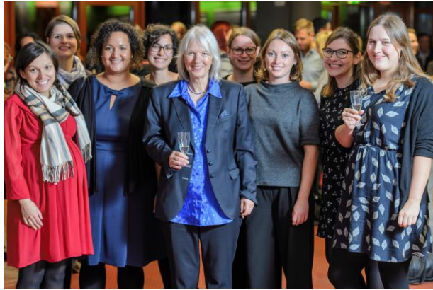
(Konstanz, Oct. 29, 2018)