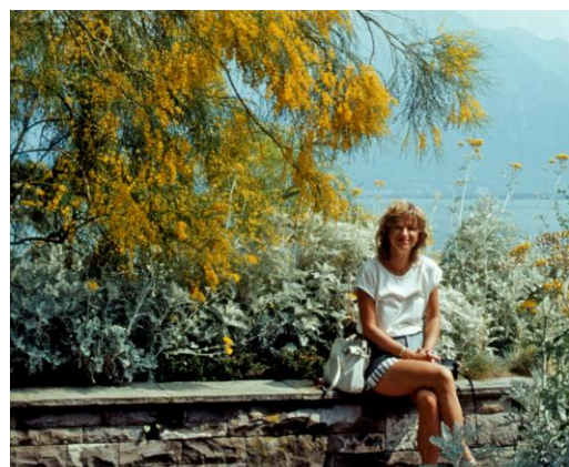
(Montreux, Lake Geneva, July 1984)