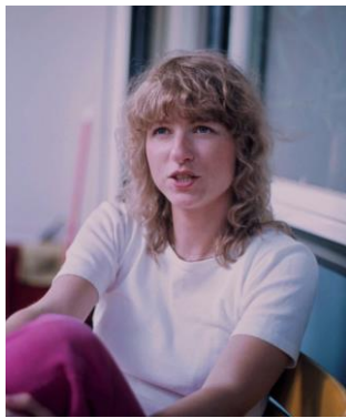
(Cologne, Aug. 1981, aged 28)