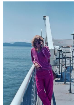
(University of Ottawa, Montreal, British Columbia, all July–Sept. 1981, aged 28)

... and also left some time for recreational travels, here to Amsterdam and vicinity: