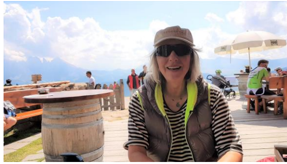
(Aug. 2017, aged 64)

In the summer of 2017 relaxing in the Italian Alps (yet taking “Canada” along, see cap):