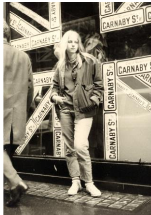
(London, summer 1968, aged 15)