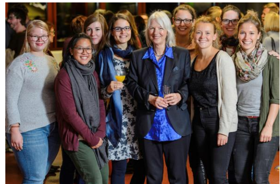
(Konstanz, Oct. 29, 2018, with former students)