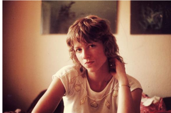
(Cologne, June 1982, aged 29)