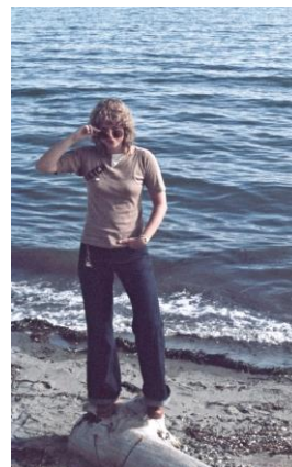
(Vancouver, March 1979) (Vancouver, June 1979)

Editorial Beginnings: Back in Cologne, a few months before the oral doctoral exam, at an editorial meeting concerning the staff-student-edited English Seminar magazine Caterpillar :