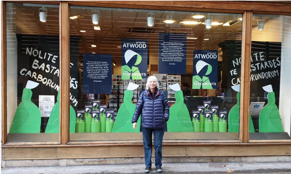
(London, UK, Sept. 22, 2019)