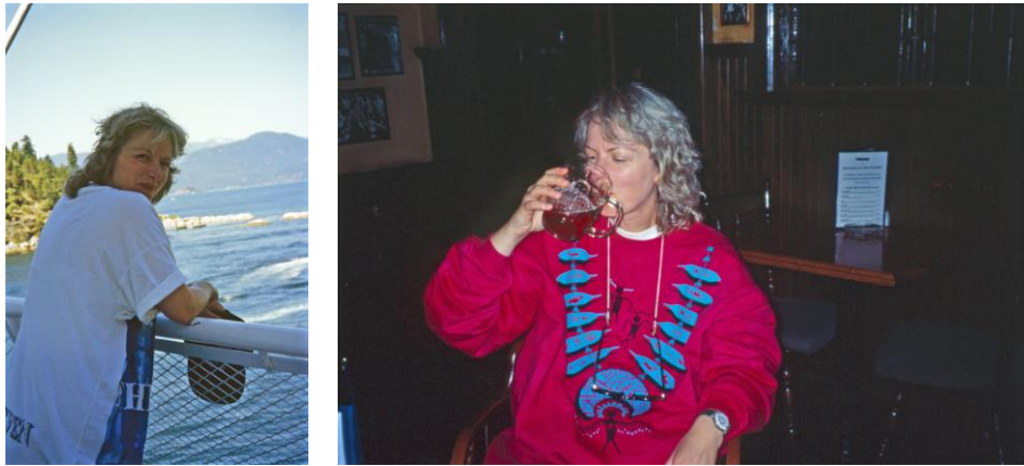
(July–Aug. 1994, aged 41)

Even more happily celebrating the appointment as Chair of American Literature at the University of Konstanz in 1994 with another trip to Canada and the United States (here in British Columbia and in a restaurant in Vancouver):