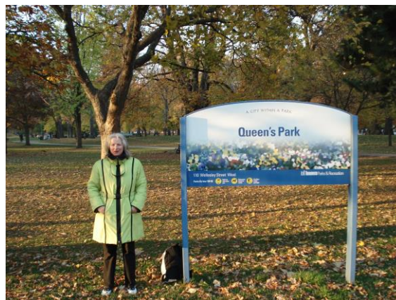
(Nov. 11, 2006, aged 54)

Trip to Vancouver and Toronto in October–November 2006, here in Toronto, Queen's Park: