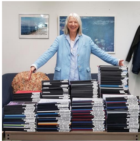
(Sept. 27, 2018)