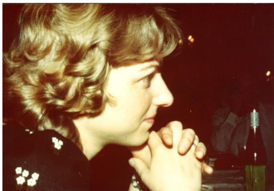
(summer 1976, aged 23)