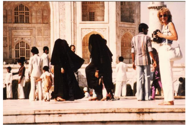
(India, Agra, Taj Mahal, March 1984, aged 31)